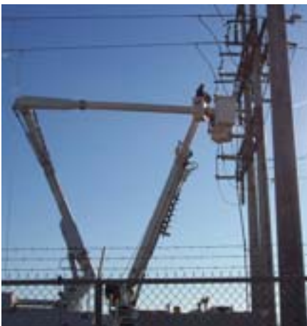
Crews work on a transmission line at Cooper/Enloe in Delta County.