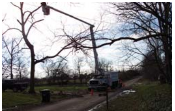
Whitmire Line Clearance crews trim trees at Bairdstown in Lamar County.