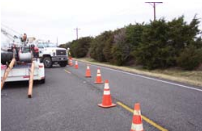
Will Armstrong flags traffic while crew members build new line in Emberson.