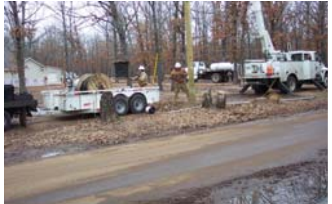
Lance Swaim and Ronnie Bridges prepare to run a new underground line to a house under construction in Reno.