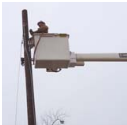
Ronnie Bridges works from a bucket truck on a line under construction at White Rock in Red River County.