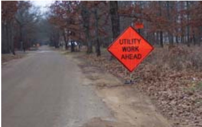
When you see this sign, be alert. This one warns drivers that crews ahead are working on a new underground line in Reno.